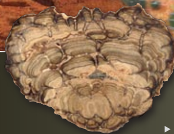
◀ Fossil stromatolite cross section

2 BILLION YEARS AGO: Photosynthetic living organisms have given Earth's atmosphere a small percentage of oxygen, dramatically altering its chemical action. Ferrous ( \text{Fe}^{2+} ) iron minerals common in black basalt are oxidized to rust-red ferric ( \text{Fe}^{3+} ) compounds. This "Great Oxidation Event" paves the way for more than 2,500 new minerals, including rhodonite (found in manganese mines) and turquoise. Microorganisms ( green ) lay down sheets of material called stromatolites, made of minerals such as calcium carbonate.