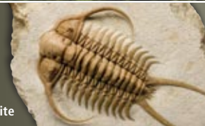
► Fossil trilobite

pounds. From space, Earth's continents two billion years ago might have looked something like Mars, albeit with blue oceans and white clouds providing dramatically colorful contrasts.