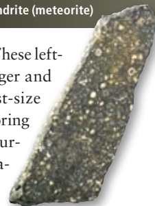
▶ Chondrite (meteorite)