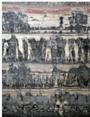
▲ Cap carbonate

Life’s earliest manifestations—primitive single-celled organisms that “fed” on the chemical energy of rocks—cannot have had much effect on Earth’s mineralogical diversity. To be sure, geologists have found biologically mediated rock formations dating back to 3.5 billion years ago, including reefs made of calcium carbonate and so-called banded iron formations (in which iron oxides apparently lock away the first oxygen produced by life). But the land was still barren, the atmosphere at large still lacked oxygen, surface weathering was slow, and the earliest life contributed almost nothing to alter the number of minerals present or their distribution.